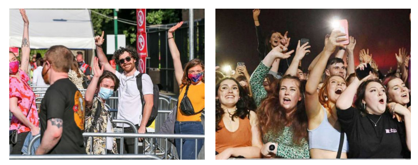
Why do people like going to public events?