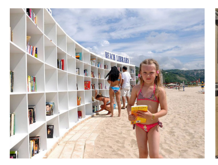
What can people do in the library?