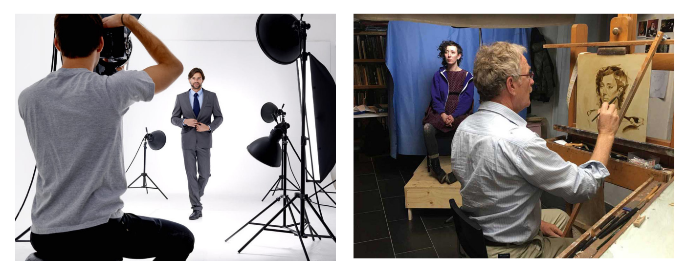
Does painting require more skills than photography?

Describe, compare and contrast the pictures. Then answer the question below.