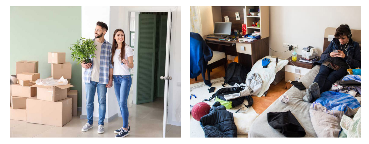
What makes a good home?